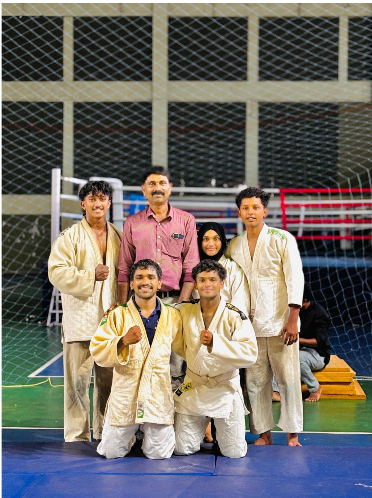
M.S.M. College, Kayamkulam — Runner-up in Kerala University Judo Men's Championship. The team secured 1 Gold, 2 Silver, and 2 Bronze medals. Congratulations, Team M.S.M.!